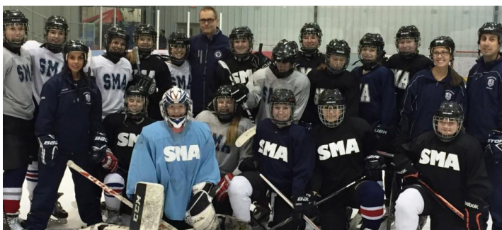
Flames High School Hockey Team with Guest Coach, Paul Maurice