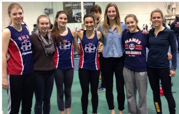
SMA high school athletes at Track & Field Provincial Championship along with alumnae that compete at the university level