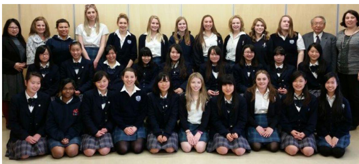
Japan Cultural Exchange, Official Closing Ceremony