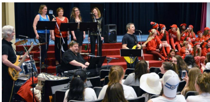
Hess and the Mess performing at Spirit Days